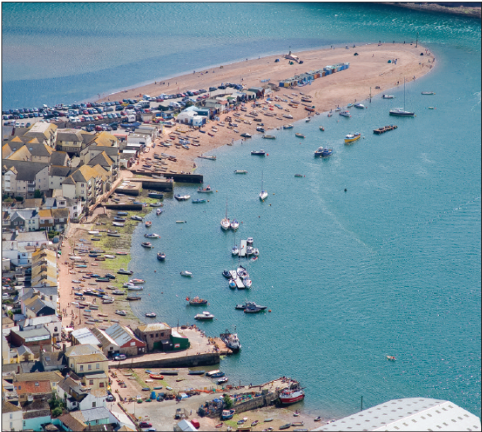
The Salty forms a natural little harbour, with the houses of Teignmouth sitting alongside.