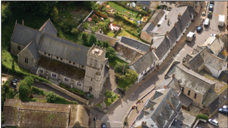
Looking down on to Fore Street, Beer.