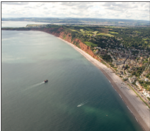
Looking north over Budleigh Salterton