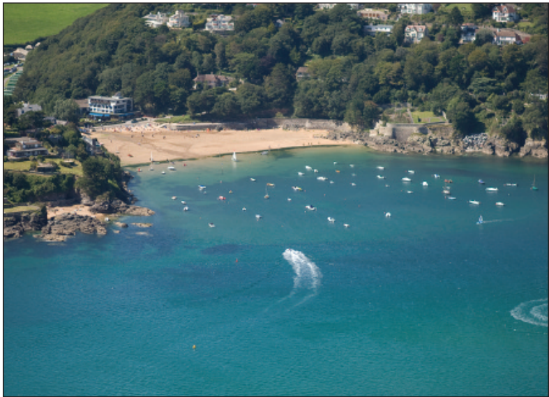
South Sands lies at the mouth of Salcombe Harbour.