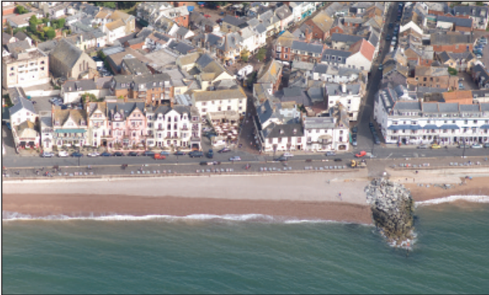
The Esplanade, Sidmouth.